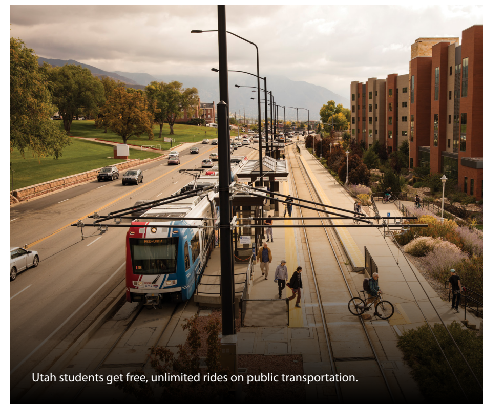
Utah students get free, unlimited rides on public transportation.

Utah Global students can choose from multiple housing options and dining plans. The Peterson Heritage Center Dining Room is centrally located and features multicultural and food-sensitive menus suitable for all dietary needs.